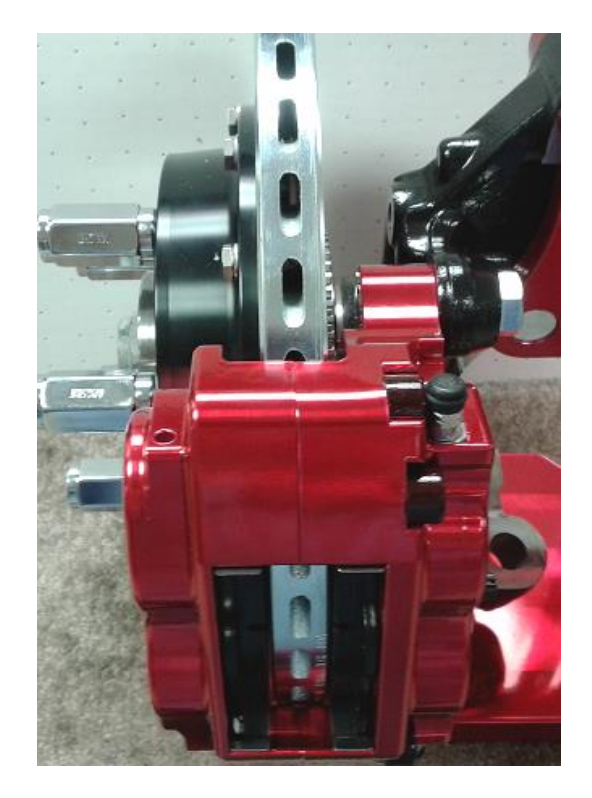
Figure 2: Caliper installed (side view)

7. Determine the proper length hose for the setup on your vehicle. You may be able to reuse the OE hoses. Install the brake hose using the supplied banjo bolt and new copper crush washers. The crush washers are installed on the each side of the banjo bolt that screws into the caliper. **IMPORTANT: Position the hose to avoid interference with the wheel and suspension components through the entire range of motion.