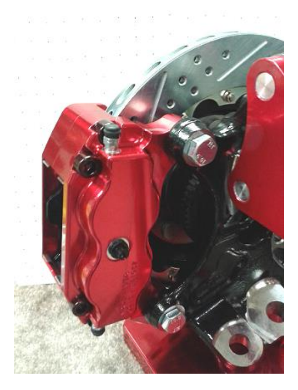
Figure 1: Caliper installed (inboard view)